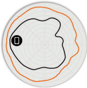
Figure 2. T670 2.4GHz Azimuth Antenna Patterns