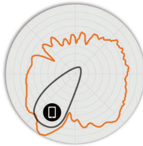
Figure 6. T670 5GHz Elevation Antenna Patterns