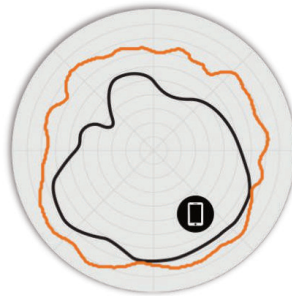
Figure 3. T670 5GHz Azimuth Antenna Patterns