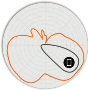
Figure 5. T670 2.4GHz Elevation Antenna Patterns