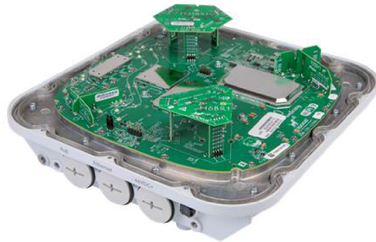
RUCKUS BeamFlex Smart Adaptive Antenna