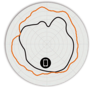
Figure 4. T670 6GHz Azimuth Antenna Patterns