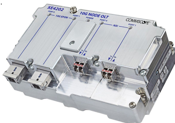
Aurora Networks PON Evo 200E Series R-OLT

For subscriber access, the 200E Series R-OLT includes two XFP ports, each supporting coexistent symmetric 1G EPON, 2/1G Turbo EPON, and 10/10G EPON in coexistence mode. Each PON port fully supports interoperability via DPoE V2.0 OAM and supports 128 ONUs for a total of 256 subscriber ONUs per R-OLT module.